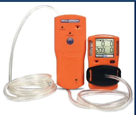
Figure 1: Setup for remote sample and bump test